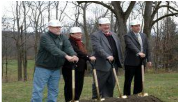
SPCA Ground Breaking Ceremony